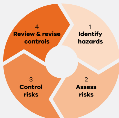
Figure 1: The four-step risk management process.

This is part of a series developed with WorkSafe to help installers in our programs work safely in the solar industry.