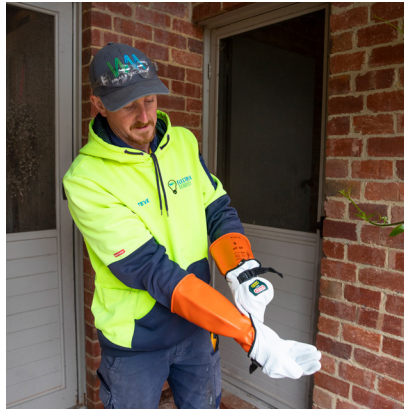
Above: Employers must provide workers with appropriate personal protective equipment (PPE) e.g. insulated gloves, eye protection, safety footwear, suitable clothing, hard hats.

Note: Any damaged electrical cables or equipment identified will need to be notified to the property owner and repaired by a licensed electrical installation worker.