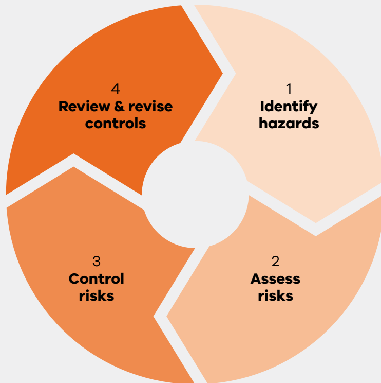
Figure 1: The four-step risk management process.

Note: Electrical installation work must only be carried out by a Licensed Electrical Worker (LEW) and all electrical apprentices must be provided with effective supervision. See the Energy Safe Victoria website for guidance: Requirements for the effective supervision of apprentice electricians.